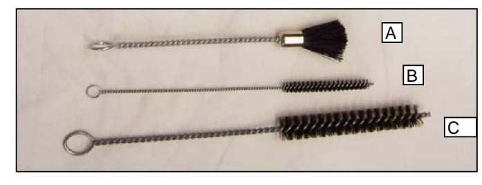
A. OMX-88 flat brush